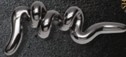
SILVER NECKPIECE - WOUND UP