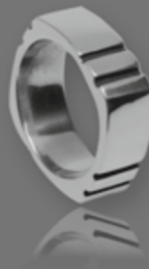
LEIGH-Z thing 1